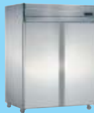
HUS-B17W Double door upright fridge

External Dimensions: 77.59x60.04x29.92" (HxWxD) Capacity: 46.26 cu.ft. Weight: 332.9 lbs. Temp range: 32°F-50°F Refrigerant: R134A Shelves: 8 Castors: 4 (2 lockable) Defrost: Automatic Voltage: 110v/60Hz Consumption: 6.96kWh/24h Container Qty: 22 Approval: CE